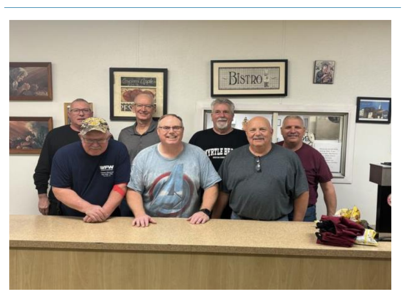
On Wednesday, April 3 the Harmony Singing Society suppled the main course for lunch and helped serve at the Johnstown Family Kitchen. Thank you, your help is much appreciated.