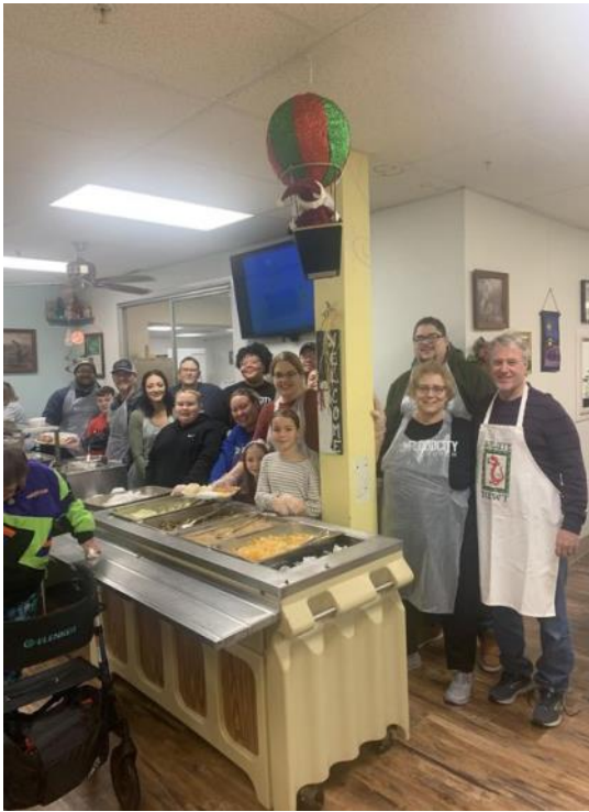
A big thank you to the Flood City Church members for serving lunch on January 1, 2024 at the Family Kitchen in Johnstown .