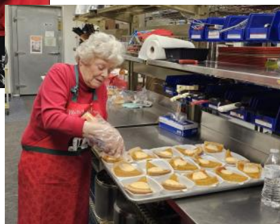
On the right a volunteer is preparing dessert for the daily luncheon.