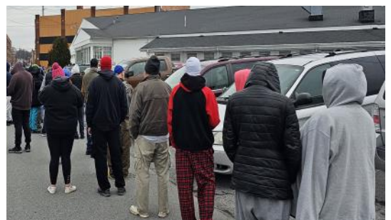
Above people waiting to get into the Altoona kitchen. Below are boxes of food ready for distribution and volunteers ready to assist.

The Kitchen is located at 231 Bedford St, Johnstown and is open Monday through Friday. (814) 539-7811