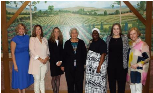
2023 WISE Women of Blair County Honorees