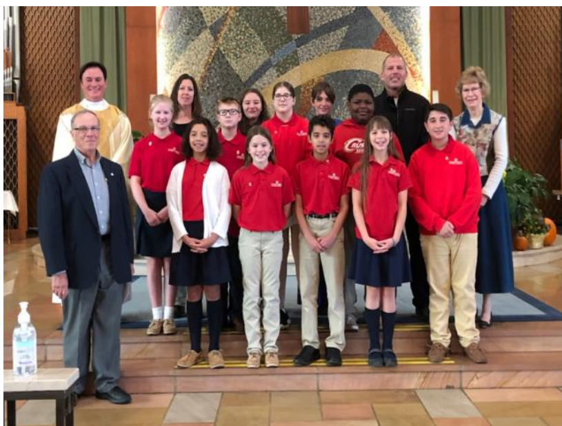
Divine Mercy Catholic Academy Johnstown East Campus SVDP 6 th Grade Youth Conference.

Dinner, prepared by St. Benedict Conference members, includes Turkey, Ham, Mashed Potatoes, Gravy, Stuffing, Vegetable, Cranberry Sauce, Roll and choice of Apple or Pumpkin Pie.