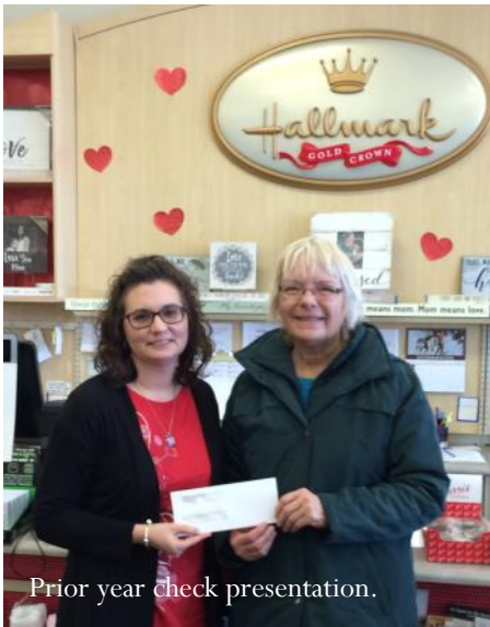
Prior year check presentation.

Barbara's Hallmark will, again this year, be holding a Gift of Giving Event over the Thanksgiving weekend. Last year over $800 was raised for the Food for Families Family Kitchen in Johnstown.