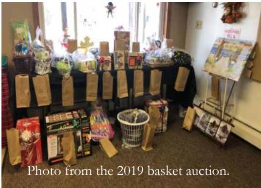
Photo from the 2019 basket auction.

The Carrolltown Thrift Store is holding a basket auction again this year. The auction started on Wednesday, September 22 and will end the morning of Friday, October 15. The drawing will begin at Noon on October 15; winners do not need to be present.