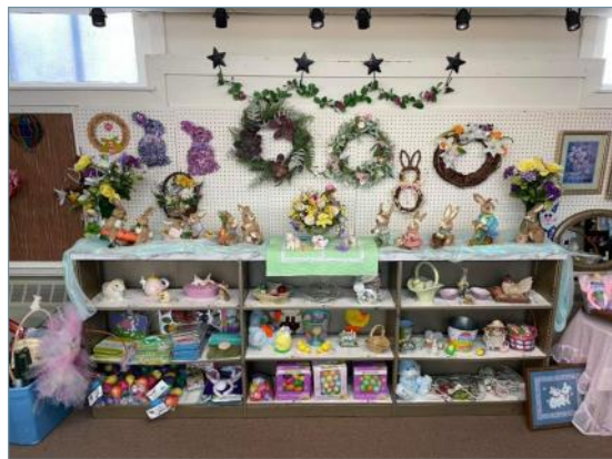
Nanty Glo thrift store ready for spring.

If you are interested in seeing what is available click on the thrift store on the right to go to the individual stores Facebook pages.