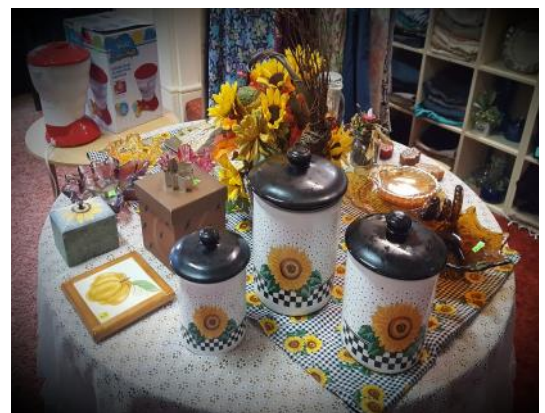
Some of the fall treasures available at the SVDP thrift store in N. Cambria.