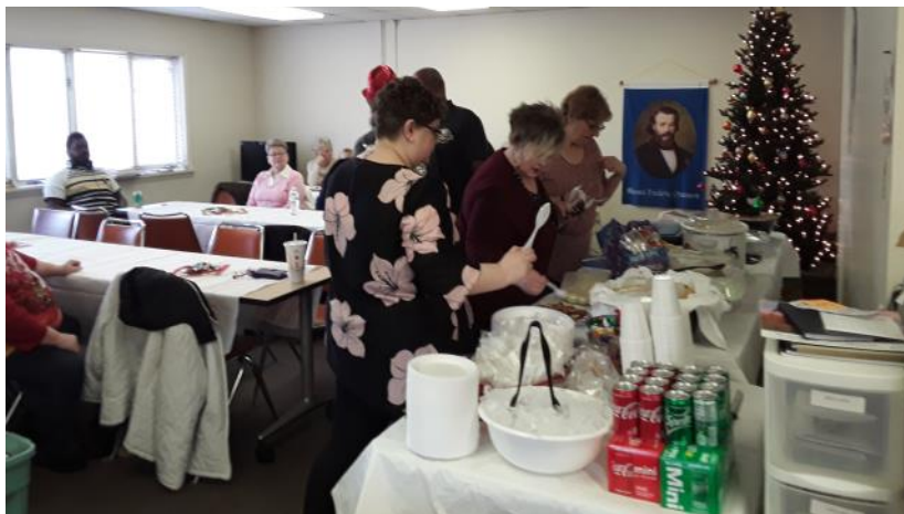
Altoona Christmas Party