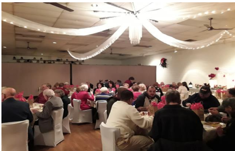
Johnstown Christmas Party

Holy Name Conference Christmas dinner was held at Kostas Restaurant in Ebensburg. Approximately 40 conference members, and thrift store and pantry volunteers attended.