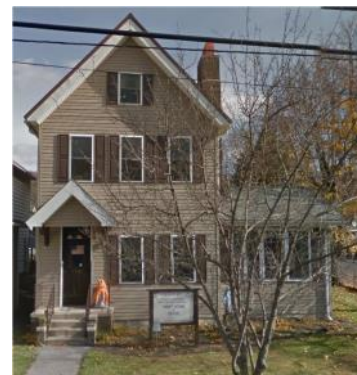
Northern Cambria Thrift Store 1907 Bigler Ave, N. Cambria

In October, Northern Cambria received a call from a family who lost everything in a house fire. Two young parents with two grade school aged boys. The Salvation Army provided a $100.00 dollar gift certificate to Walmart which was very helpful but all the clothing the family had was on their backs. It was a holiday weekend so there was not much available in the way of help for the family.