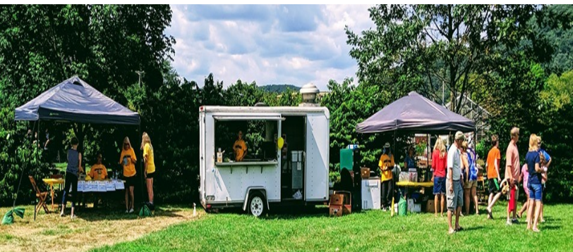
Regatta participants from the Stiletto Network & Ideal Markets.