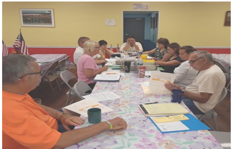
Planning committee for the Johnstown SVDP soup kitchen finalizing plans for the annual Duck Race on Sunday, August 5.