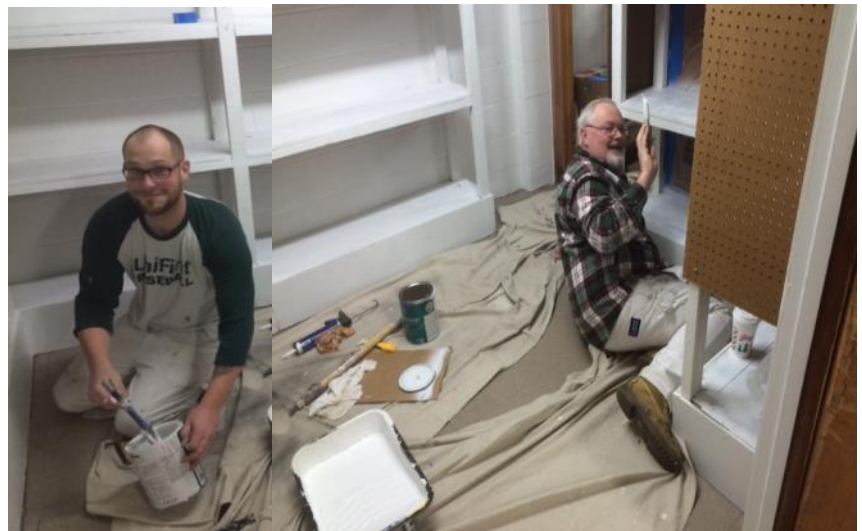
Assumption Chapel Food Pantry gets a fresh coat of paint over the holidays.