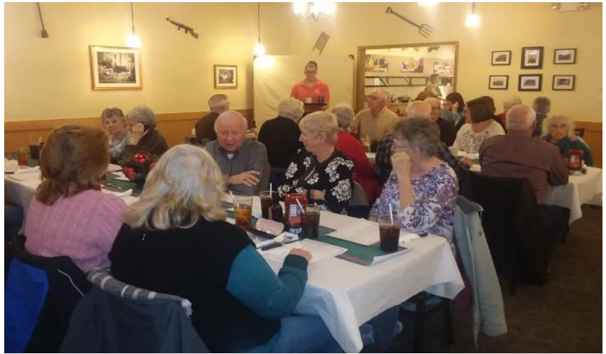
The SVDP Peter Lemke District Council held its annual holiday dinner on Wednesday, January 10, 2018 at Hoss' in Ebensburg. 114 volunteers and members attended.

Save the date and plan on celebrating with your fellow Vincentians, volunteers, and supporters from across the diocese.